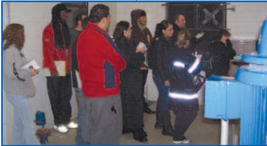
Nassau Community College students visiting the Plainview Water District.